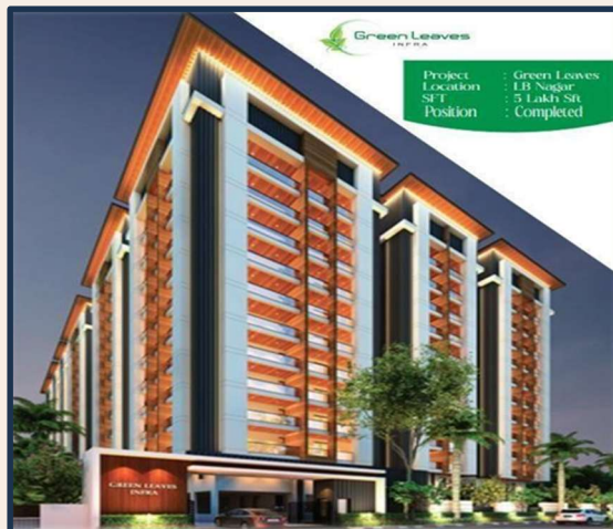
Green Leaves INFRRA