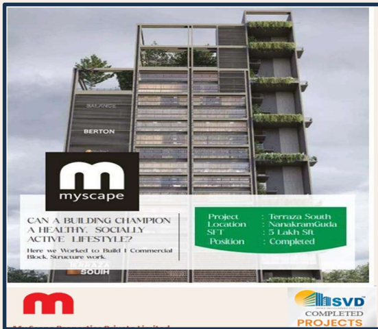
MY Scape Building: Terraaza South Tower