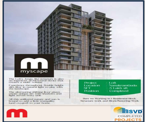
My Scape Properties Private Limited